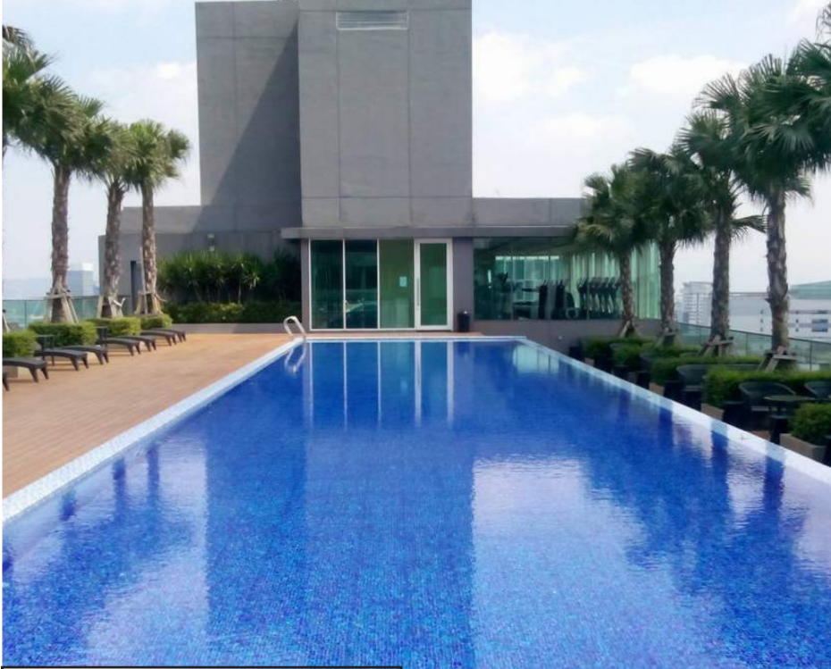
VIPOD RESIDENCES, JALAN KIA PENG