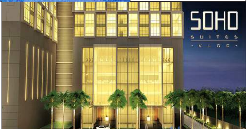
SOHO SUITES @ KLCC, JALAN PERAK