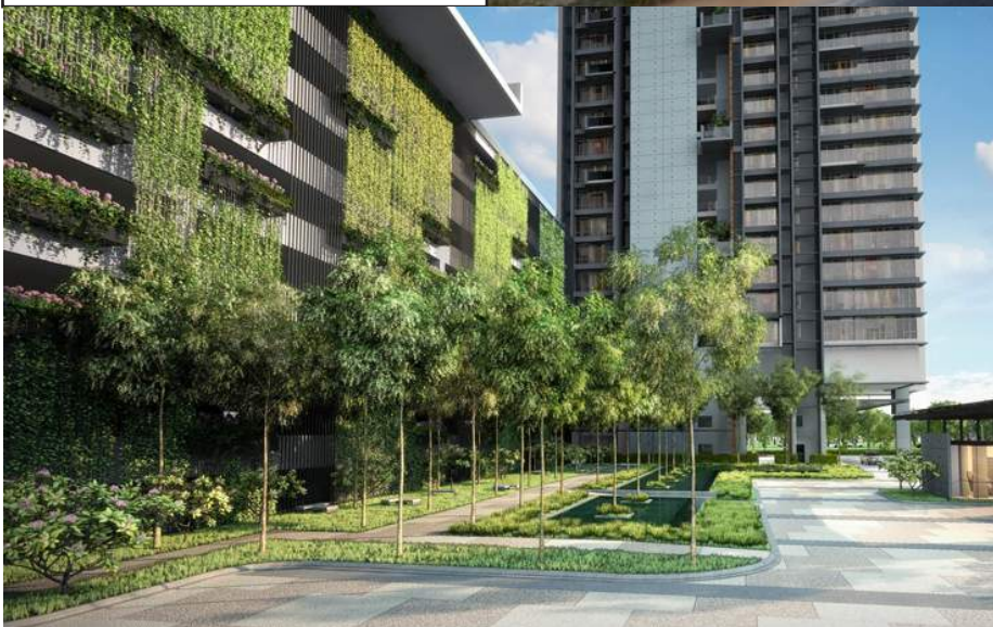
GRAND MEDINI, ISKANDAR MALAYSIA