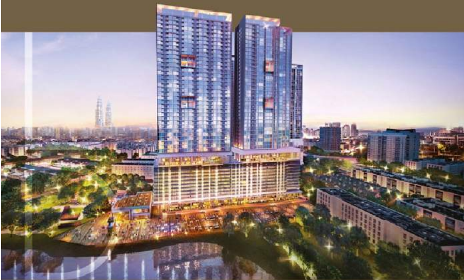
ANYUMAN SUITES, GOMBAK