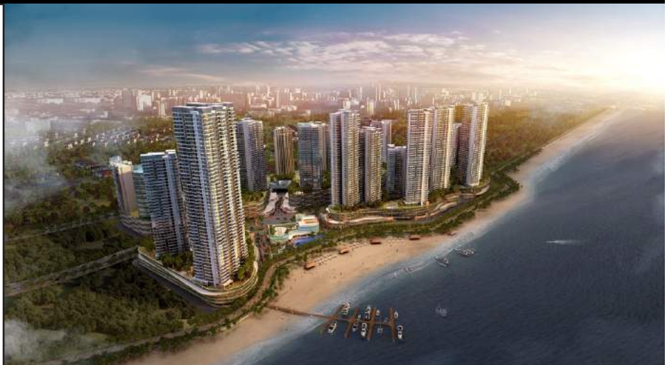
COUNTRY GARDEN DANGA BAY, JB