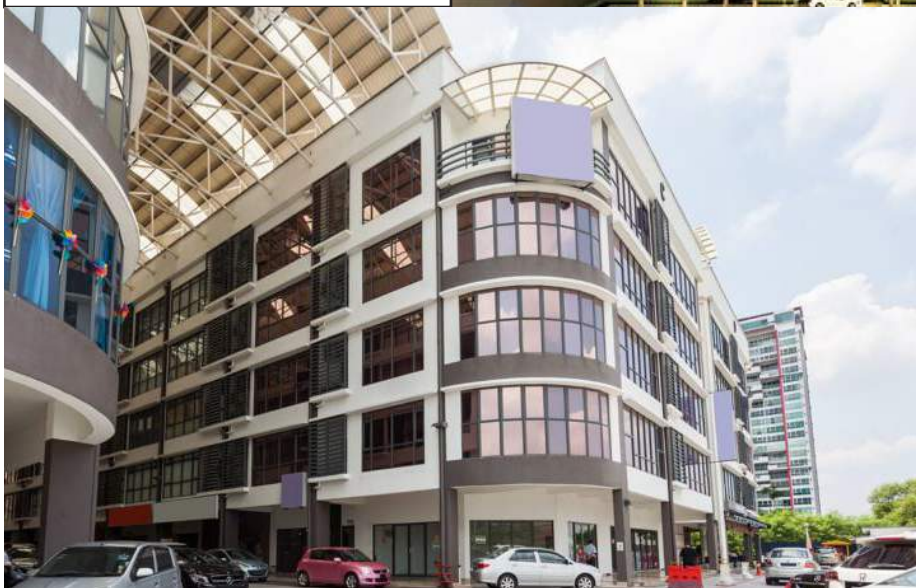
SERI GEMBIRA, HAPPY GARDEN (OKR- COMMERCIAL)